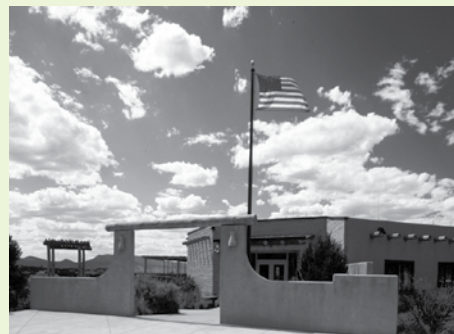
El Malpais Ranger Station is open seven days a week from 8:30 a.m.-4:30 p.m.

Check in with the Ranger Station, (9 miles south of I-40 on NM 117) for more information on this hike as well as other great hiking opportunities within El Malpais.