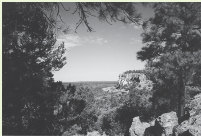
The views from the narrows rim are spectacular to say the least. Going to the far end, a distance of 3 miles, will result in excellent vistas.

Narrows Rim Trail gives hikers the opportunity to witness geologic processes, thousands of years apart. Stroll along the ancient mesa top and view the much younger lava flows below. This remarkable scenery of the lava beds and surrounding countryside ends with a picturesque view of La Ventana Natural Arch.