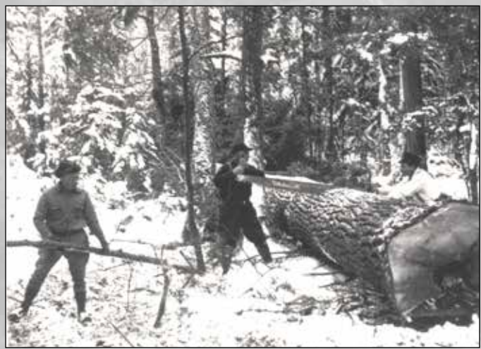
Logging with a cross-cut saw.